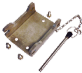
MOUNTING BRACKET for 9 m, 15 m, 25 m and 40 m Sealed-Blok™