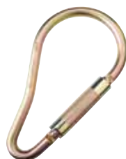
SAFLOK™ STEEL CARABINER Self Locking/Closing, 50 mm Gate Opening