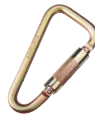
SAFLOK™ STEEL CARABINER Self Locking/Closing, 30 mm Gate Opening