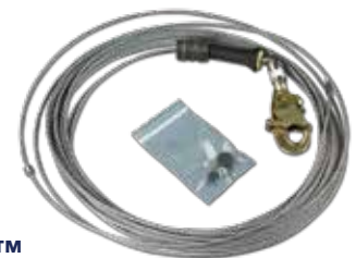
CABLE REPLACEMENT ASSEMBLY FOR FAST-LINE™