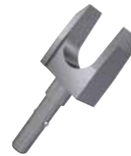
ASSISTED RESCUE TOOL ONLY If you already have a First-Man-Up™ Pole