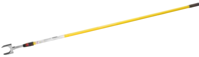
FIRST-MAN-UP™ POLE (2.4 - 4.8 m) with Assisted Rescue Tool